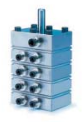
Eight-outlet port Spin Finish Pump