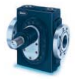
Pressure Increase Pump with double jacket

Vacuum Discharge Pump with double jacket