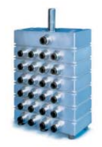
Twentyfour-outlet port Spin Finish Pump