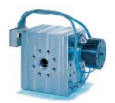
Pressure Increase Pump with electric heating elements

Vacuum Discharge Pumps with double heated jackets guarantee the optimal discharge of highly viscous polymers from reactors, with only slight product shearing.