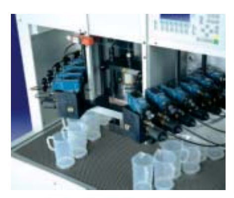
Discharge and pressure test on Test Stand