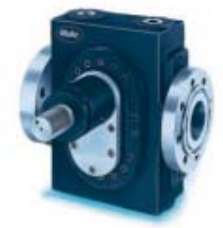
Pressure Increase Pump double jacketed for liquid heating/cooling