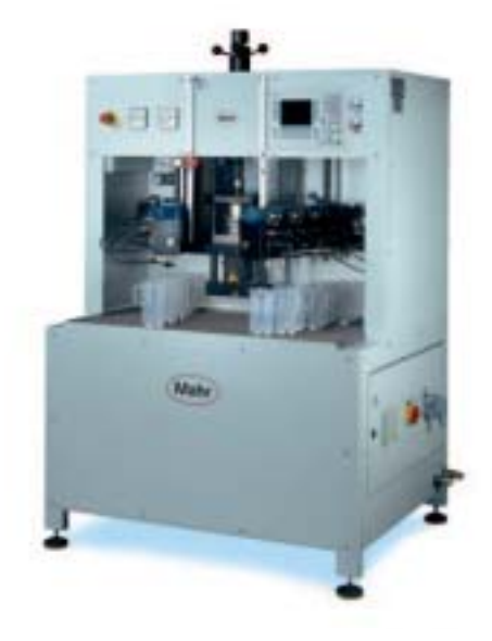
Test Stand for twelve-outlet port Spinning Pumps

a preset counter-pressure. The delivered flow rate of the discharge ports is then measured under various differential pressures and precisely documented. For increased testing accuracy, the test is carried out under defined conditions with a low-viscosity silicone oil (e.g. 0.5 Pascal). All other testing conditions remain constant while the discharge pressure is adjusted to the correct differential pressure. The fluid metered through the Pump is collected and weighed. Evaluation of these measurements gives the two vital Pump values needed to assure the discharge quality: the "metering accuracy" and the "delivery deviation" of the Pump discharge ports at various differential pressures. These results give you the certainty that everything is running the way your production process requires.