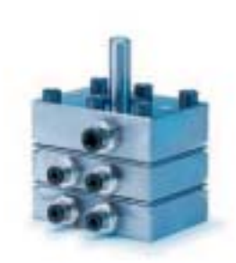
Four-outlet port Spin Finish Pump