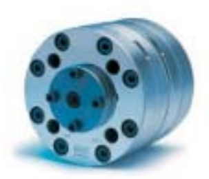
Multiple-outlet port Spinning Pump, planetary design