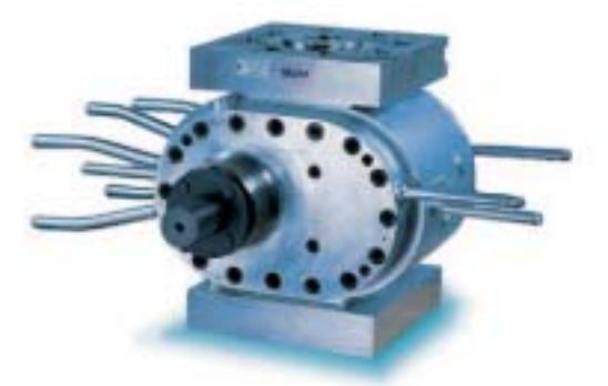
Vacuum Discharge Pump double jacketed for liquid heating/cooling