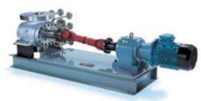
Ready-to-install system for Discharge Pump

Our comprehensive Pump range also includes an entire program of state-of-the-art measuring technology developed by Mahr. If you are looking for reliable, cost-effective Metering Equipment for the kind of consistent quality you need to keep your customers satisfied, look to Feinpruef Technology by Mahr Metering Systems. Call us for further information - we'll be glad to help.